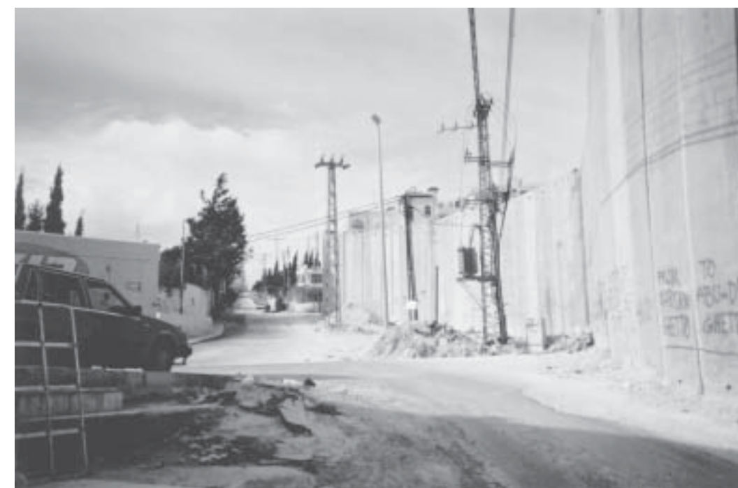
“This street used to be crowded and filled with people, but today it has no shape or character.”

كان هذا الشارع يصبح العالم أما الآن فقد أصبح بلا معالم