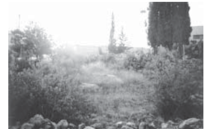
“They have oppressed nature and have planted separation and sin.”

“Israel has surpassed the international limits in oppression and terrorism. The United States doesn’t care any more because it is Israel’s number one supporter. It lets it do whatever it wants. Israel is not afraid of any European State because it’s protected by America. What kind of a state makes decisions without