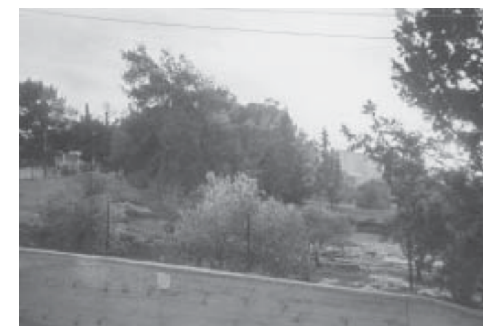
“They have uprooted the trees and planted spitefulness in our eyes.” خلعوا الأشجار من جذورها وزرعوا الحقد في عيوننا