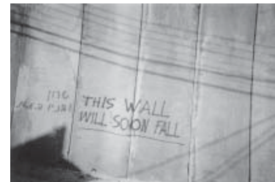
"No comment. The picture says it all, and the breaches are flagrant." بدون تعليق. الصورة واضحة والإنتهاكات فاضحة

If all the Palestinians, old or young, adults or adolescents, had objected from the beginning, no one could have or would