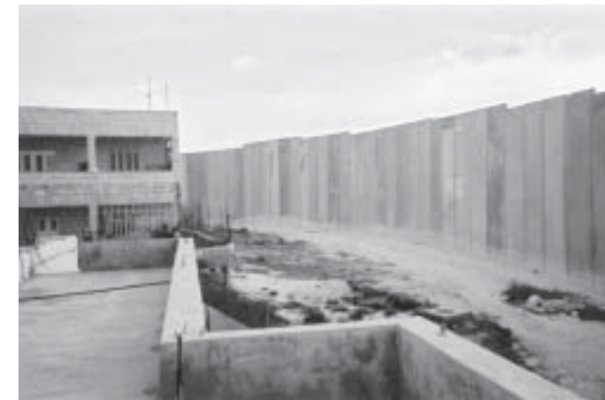
“I will grind you into tiny stones to extinguish the fire in my heart.” سأفتك إلى حجاره لأطفئ ما يقيني من ناره

When the young people shared family concerns, it became clear that the Wall has adversely affected some in very personal ways.