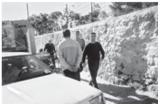
"People pass through checkpoints normally, but in them one can see the effects of humiliation and degradation." الناس بتمر عادي والذل والإهانة عليهم بادي

Women's reactions to political conflicts and war-related situations are found to differ from those of men. 60 Specifically, women's reactions and coping strategies are deeply affected by both the political context and the nature of gender relations between men and women. 61