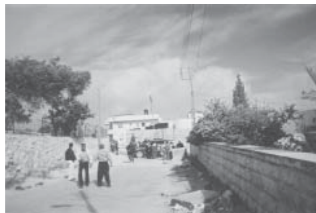
“They delayed us from going to work, and with this they destroyed our hopes.” عوقنا عن عملنا ومع هذا دمروا أملنا