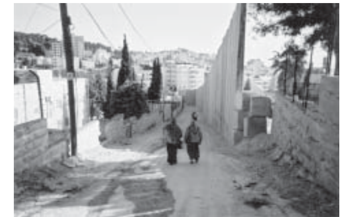
“We are not walking on our usual streets, but we can still go on towards freedom.” مش عمالنا بنمشي بشوارعنا العادية لكن قادرين نواصل الحرية

For example, Siham, a 17-year-old schoolgirl, remarked: