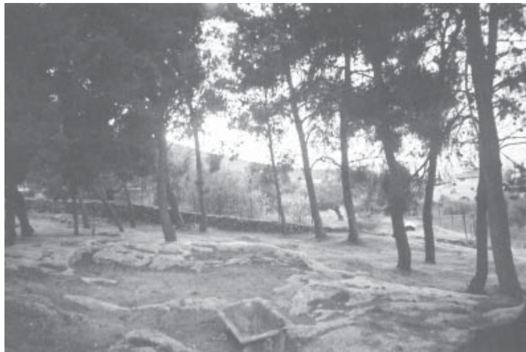
“A heaven without people is no place to be.” الجنة من غير ناس ما بتداس

The Wall will cut congregations from their mosques. Many young girls told of older people who believe that the main aim of the Wall is to prevent them from seeing the holy Muslim shrine, the Dome of the Rock, from their houses. Girls often reiterated their desire to assist their grandparents and older people by doing something about it. This attitude is reflected in such comments as “I must find a way”, “I need to do something”, and “I promised my grandfather that I will find a way to solve this problem, and that he will go back to his same habit of opening the window each morning to look at the Al Aqsa Mosque.”