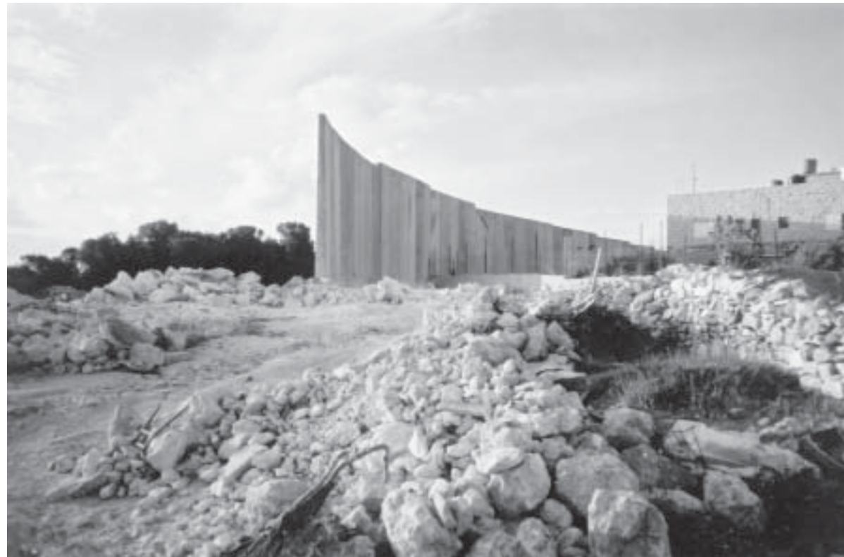
“To Be Continued”

Discussions revealed yet another troubling result. Some Palestinians have been fighting with each other, trying to prevent the construction of the Wall on their own lands. The Wall is then constructed on the land of a neighbour or a relative. One young girl offered: