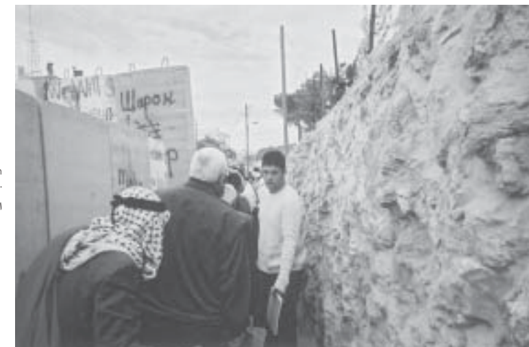
"Dozens of people walk through an opening several inches wide. الناس بالعشرات والفتحة بالسنتيمترات

Data were gathered from the 110 compositions and 19 personal narratives of the 172 girls and boys who participated in focus groups and discussions concerning the Wall. Out of these discussions, the following recurring themes were recorded, and responses were arranged according to these themes. In addition, photographs were taken and captioned by girls, as they themselves proposed. (Due to security concerns, we feared asking boys to do the same.)