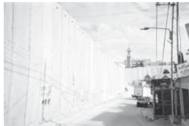
“You look like a serpent; we should seek your ruin.”

The process of unmapping the Wall, of assessing its meaning in their lives and identifying ways to counter its influence, started with adolescents' reflections on its power to dominate their and their people's lives. Their words, writings and photos undermined the claim that the Wall is a tool for achieving security. Their powerful words uncovered the ideology and practices of conquest and domination, and revealed how the Wall, while representing security for Israelis, actually undermines the personal security and sense of safety of these adolescents and their families.