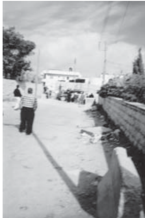
“I used to walk here happily. The day we part from you, Occupier, will be a feast day.”

Legal intervention has also helped in individual cases. Mahasen, a 16-year-old female resident of a refugee camp, reported: