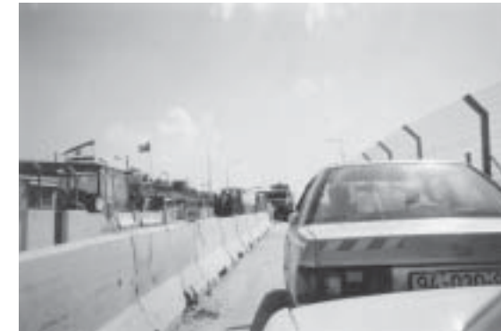
“Our destiny is controlled by cement blocks and a soldier.”