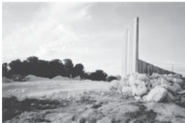
“In the West, people drive on ‘highways’; we walk on ‘no-ways’.”

“History repeats itself and events are repeated, such as the demolition, killing, arresting, discriminatory separation and forced migration away from family, home and friends. How many martyrs should fall, how many injured should bleed, how many houses should be demolished, how many should be separated from their families? History repeats itself.”