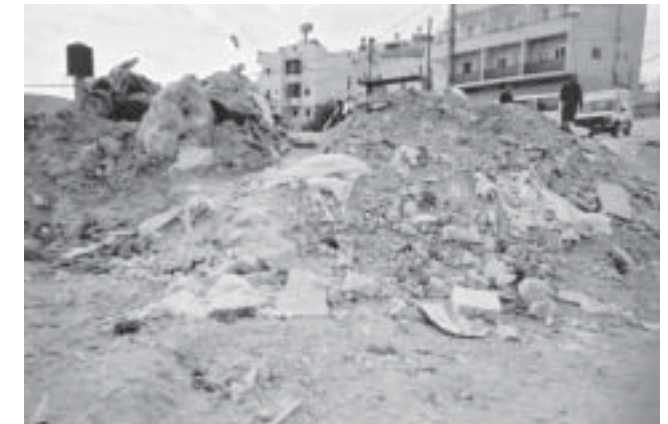
“You have defaced our environment and darkened our lives; when will you get out of our sight?”

“The problem is that Israelis control the access to food, and men in society are the ones who distribute food and even water. I could tell you what happened during the three-day curfew. Men used all their power against women, and my uncle was trying to control my mum (my father is imprisoned). He agreed to give us water only if my mum signs the paper allowing him to get the money from the bank, when it is our money – this is the only source of income to us.”