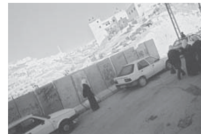
“I wouldn’t be afraid if they destroyed my house... and if they blocked my way I wouldn’t crawl.” لو هدوا البيت مش خايفة ولو سدوا طريقي مش زاحفة