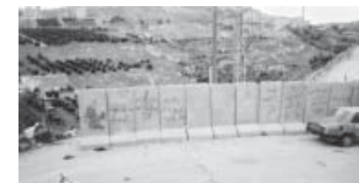
"Night must be followed by daylight."

Let me end, then, with the words of Sumaya (a 17-year-old girl) who tried to convey the message that she would continue hoping, and waiting for better times to come. In the caption for her photograph of the Wall, she expectantly wrote: "Night must be followed by daylight."